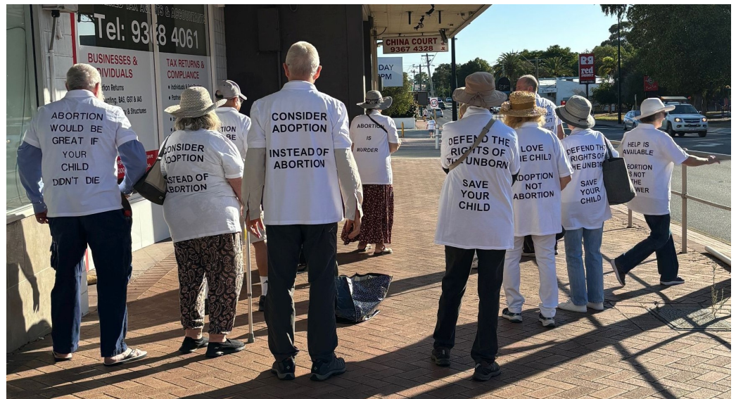
Ready to go: some of the walkers on the Canning Highway Route