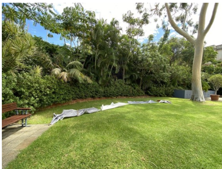
Signs down, but we had them back up ten minutes later