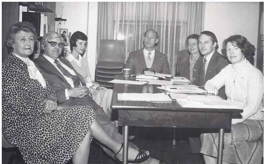
First meeting of Right to Life Federation of Australia. Unity is hard!