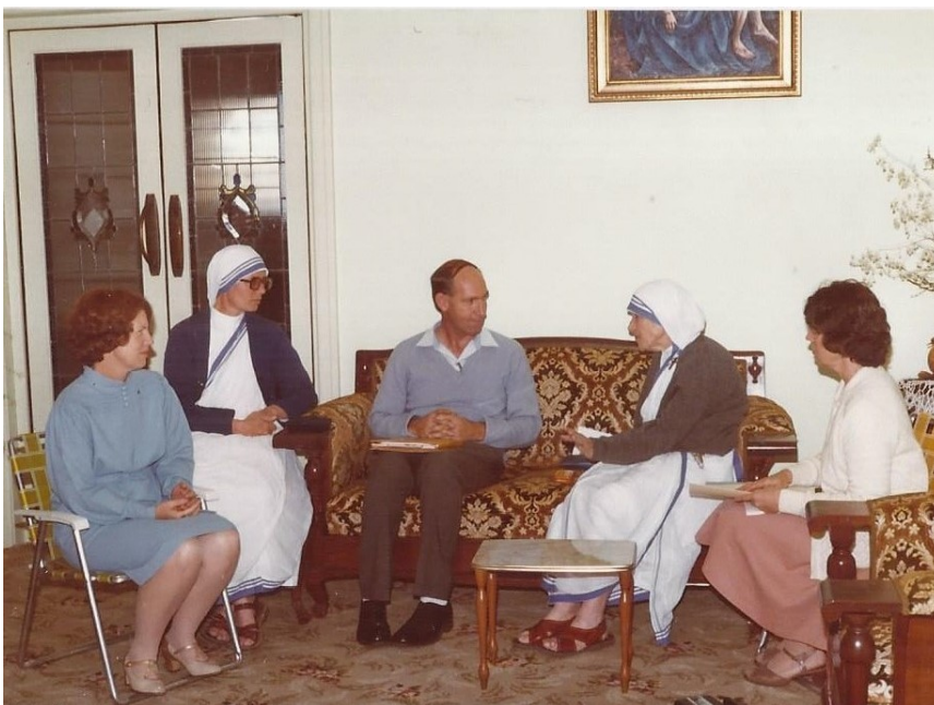
Mother Teresa visiting our then Victoria Park office