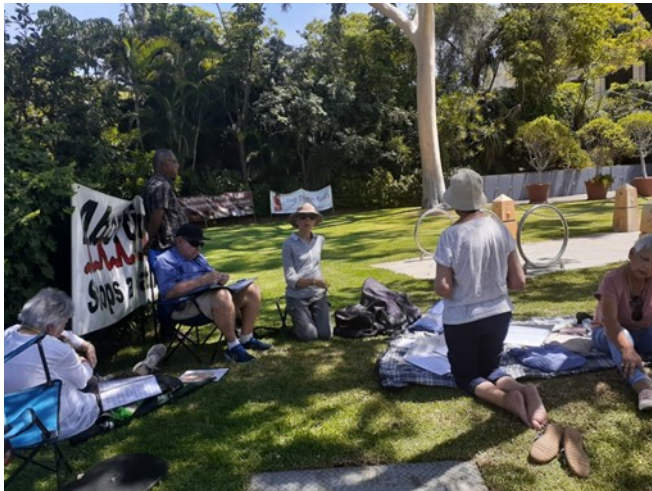
Prayer goes on, despite the heat, at least the shade is still there

Admittedly the groundspeople have insisted we finish early on two occasions so they could carry out grounds maintenance work.